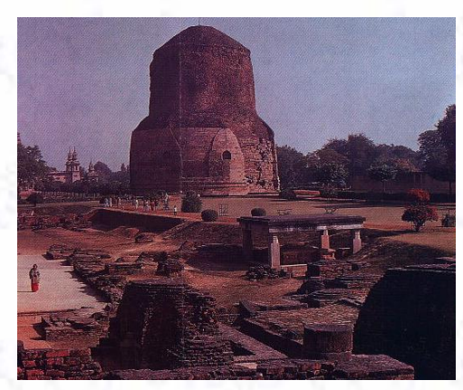
The First Turning of the Wheel of Dharma

According to popular legend, after his complete enlightenment, the Buddha gave no public teaching for 49 days. He gave his first discourse to the five who had formerly been his colleagues when he lived as a mendicant. Because he had broken his physical penances they had abandoned him and even after he had become totally enlightened they had no thoughts of reconciliation towards him. However, meeting the Buddha on his way, they naturally and involuntarily paid him respect, as a result of which he gave them his first teaching.