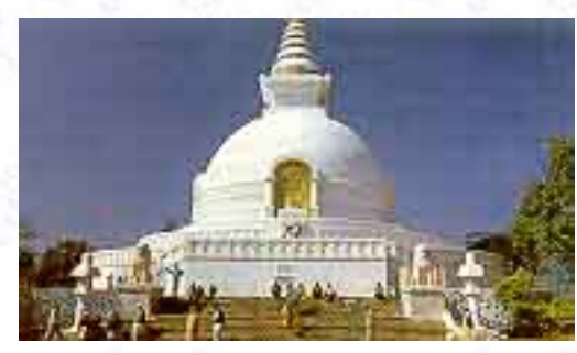
The Second Turning of the Wheel of Dharma

This is the general structure of the Buddhist path as laid down in the first turning of the wheel of dharma. Buddhism as practised in the Tibetan tradition completely incorporates all these features of Buddhist doctrine.